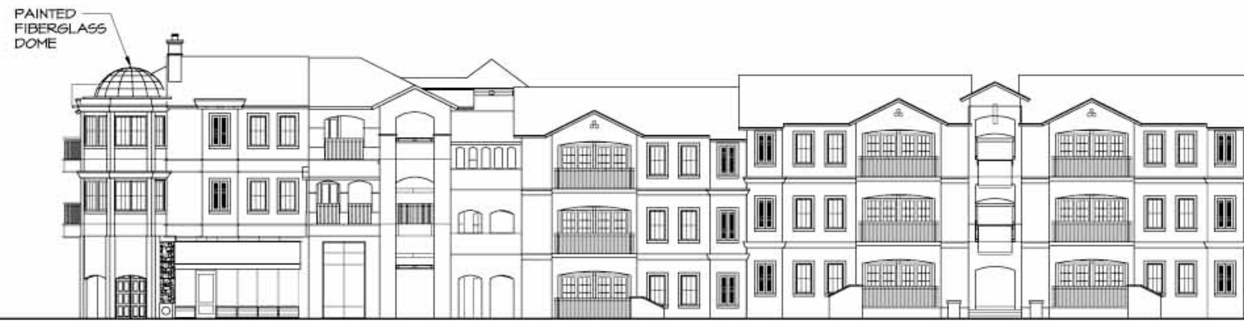
3.4 EAST APARTMENT BLOCK EXTERIOR ELEV - NORTH SCALE: 1/16" = 1'-0"