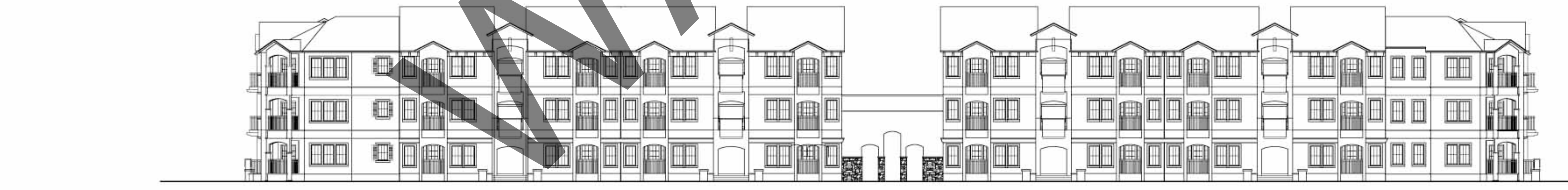
0.4 EAST APARTMENT BLOCK EXTERIOR ELEV - WEST SCALE: 1/16" = 1'-0"