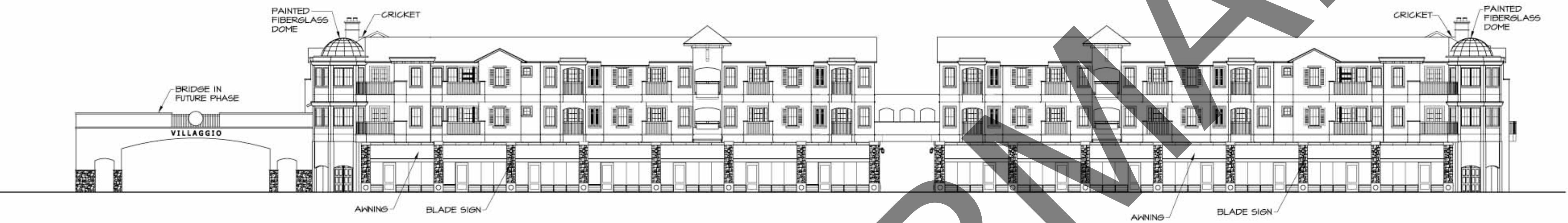
2.4 EAST APARTMENT BLOCK EXTERIOR ELEV - EAST SCALE: 1/16" = 1'-0"