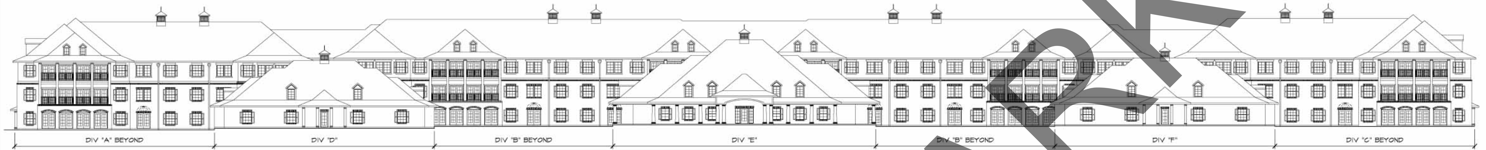
① FRONT ELEVATION 1" = 20' - 0"