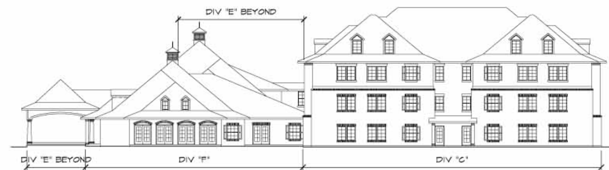
④ RIGHT SIDE ELEVATION 1" = 20' - 0"