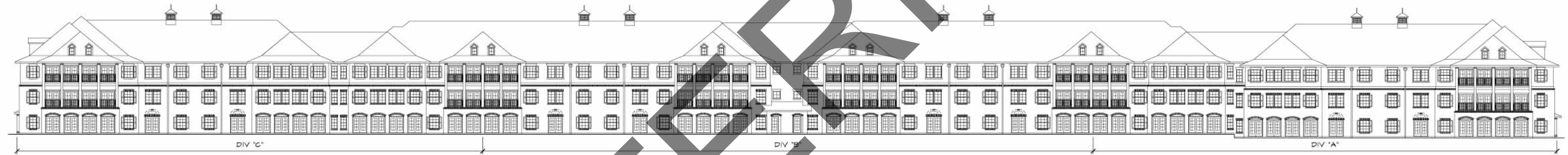
② REAR ELEVATION 1" = 20' - 0"