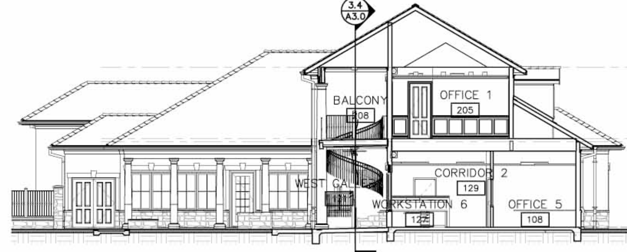
2.4 BUILDING SECTION 2 SCALE= 1/8" = 1'-0"