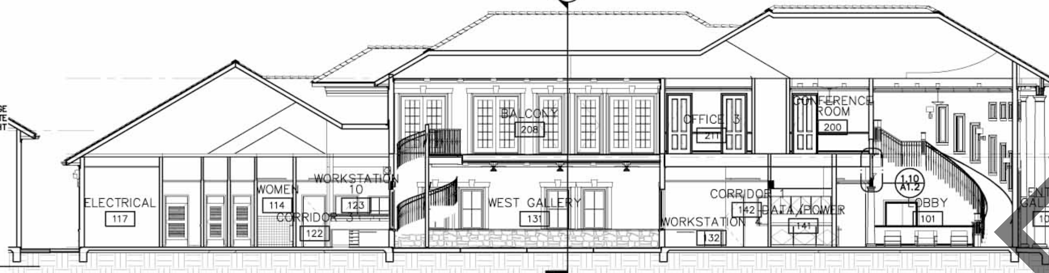
3.4 BUILDING SECTION 1 SCALE= 1/8" = 1'-0"