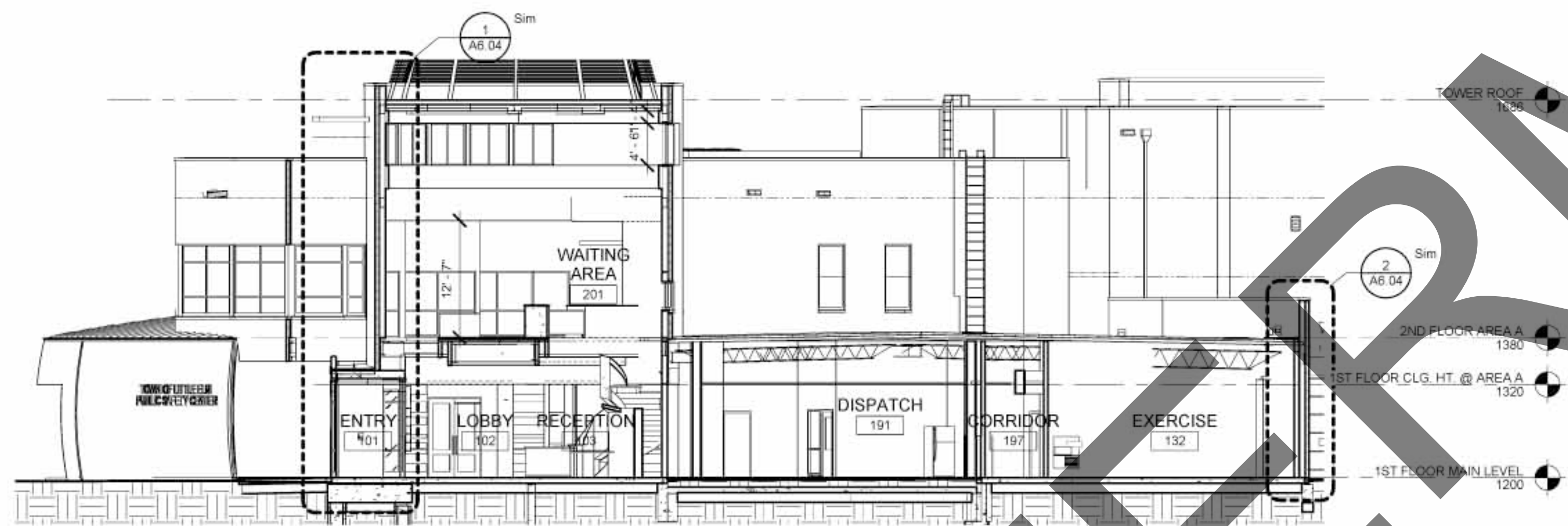
2 BUILDING SECTION 2 SCALE: 3/32" = 1'-0"