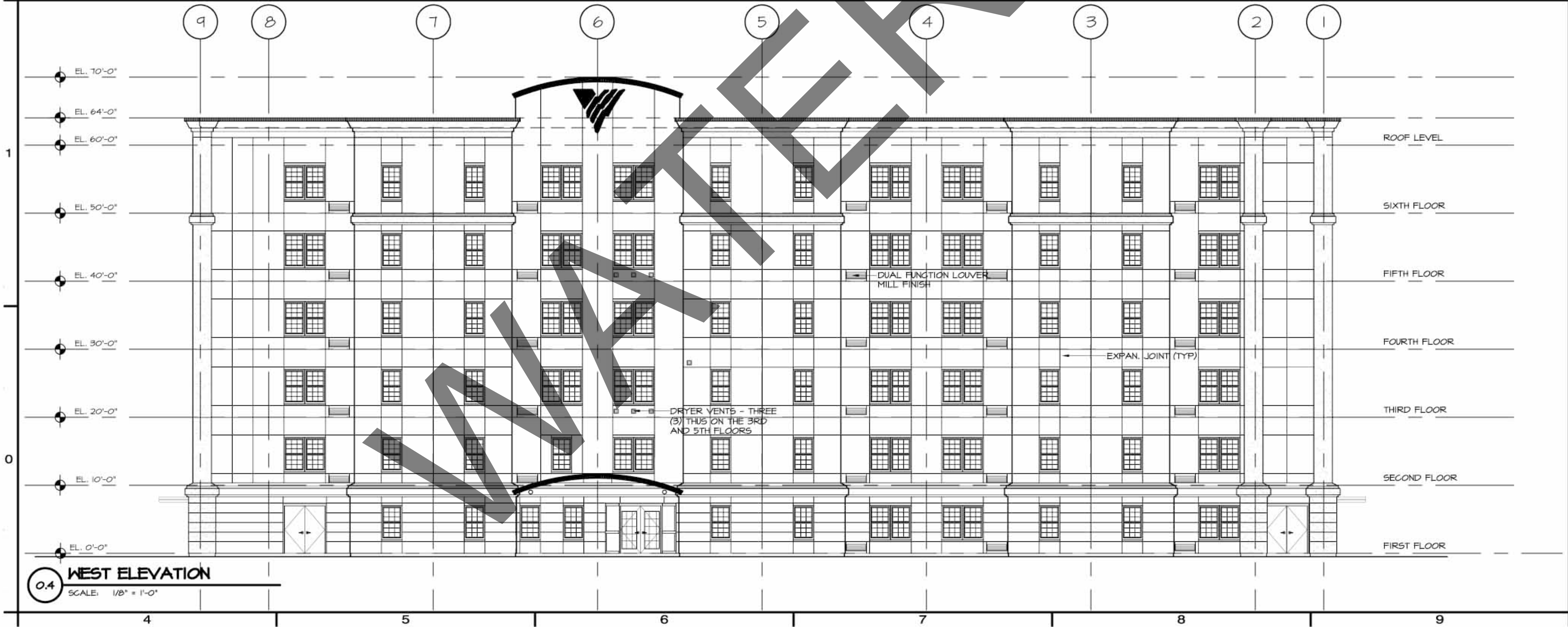
0.4 WEST ELEVATION SCALE: 1/8" = 1'-0"